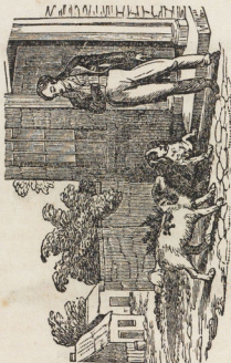
THIS TWO LAMB DOGS. PAGE 16.