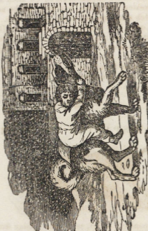
THE DOG OF ST. BERNARD. SEE PAGE 14.